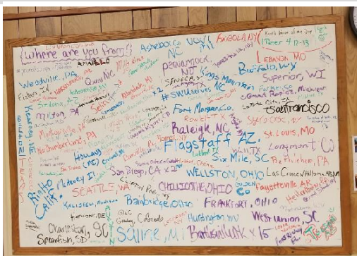
Volunteer Board from Port Arthur Texas. Hurricane Harvey deployment, 2017.